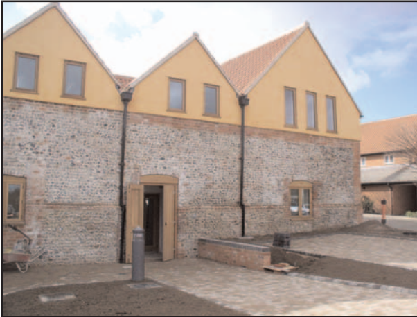
The Malthouse Project on moving in day

Central office staff officially moved into The Malthouse Project on Monday 26th