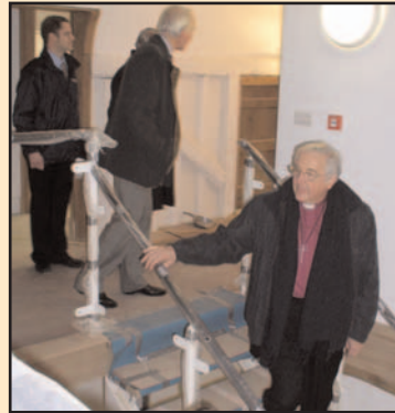
Bishop and Dean touring the site