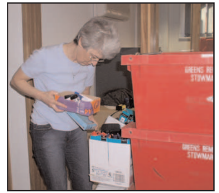
Staff unpacking at The Malthouse Project