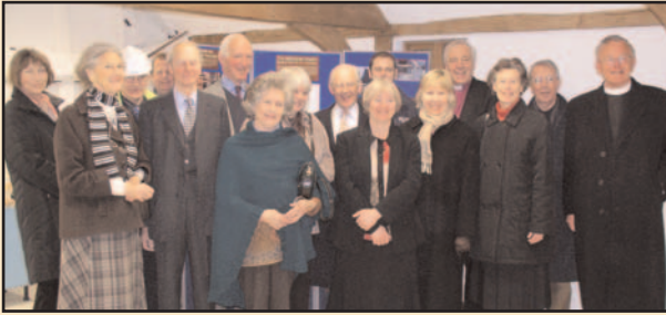
Bishop, Dean and Founding Friends with project team