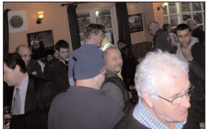
Contractors enjoying the buffet